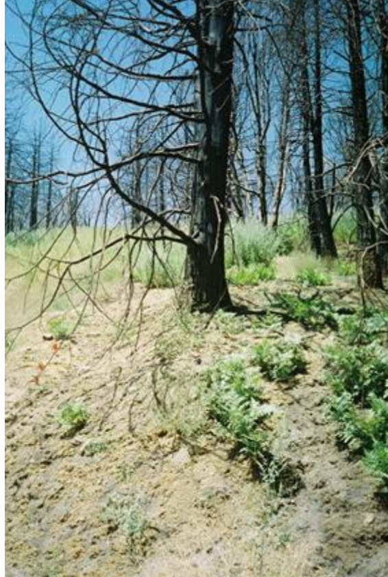
Ferns growing in TPMR area – control on left