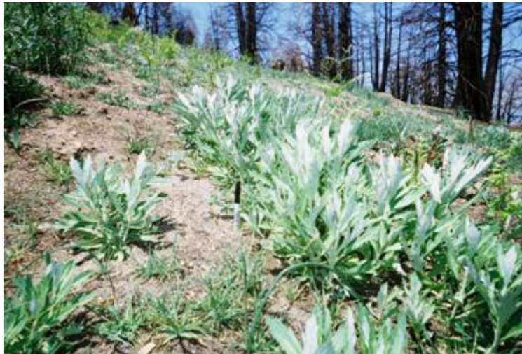
April, 2004 – vegetation in open areas

An important change in the vegetation was noted during the July, 2004 examination. It was noted that in the two-month period since April, ferns had been established and were growing to heights of 6 to 8 inches in the TPMR area and in the MR area. This step in the succession of species is very significant as it is interpreted to be due to a maturing of soil biota and a quicker return to natural conditions. As ferns are among the species known to establish an association with endomycorrhizae, it is interpreted that the fungal community in the treated areas had re-generated much more quickly in these two areas than in the untreated areas.