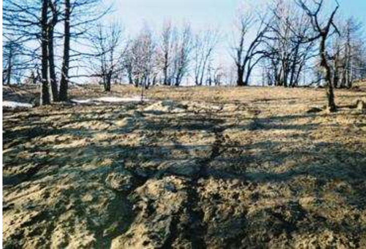
Rilling from heavy rains