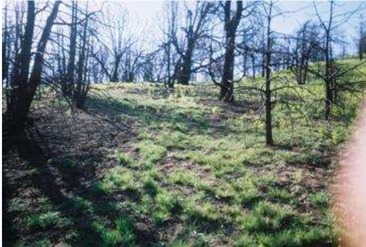
April, 2004 – vegetation established in open areas away from clusters of burned trees

Re-growth of native vegetation by April of 2004 was good in the upper slope and mid-slope areas, particularly away from burned trees or clusters of trees. The lower slope area (originally heavily treed) was still bare for the most part, which we believe was related to the severity of the burn in that area destroying native seeds and roots. The amount of vegetation cover did not appear to be a function of whether or not the ground was treated. The severity of initial burn was interpreted to have been the major control at that point in time, as non-treed areas regenerated more rapidly.