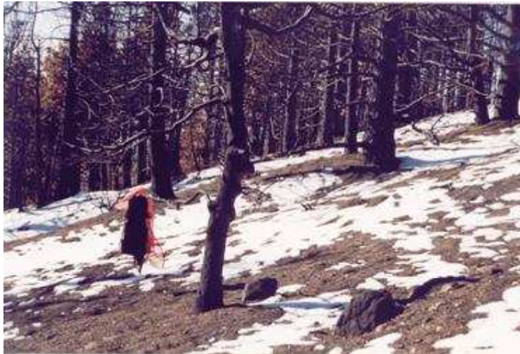
Site just prior to treatment