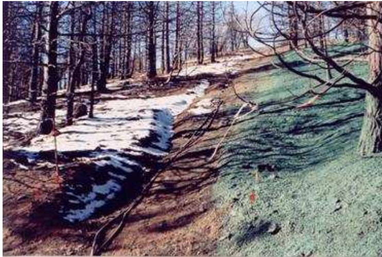
Control Area – left, Treated Area – right